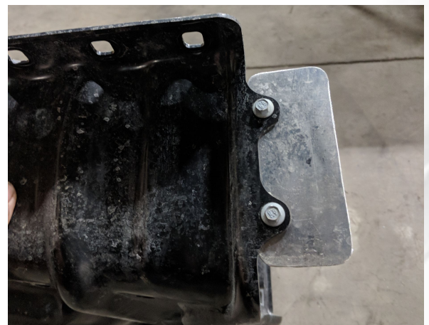
Detail 9: Remove the small silver shield