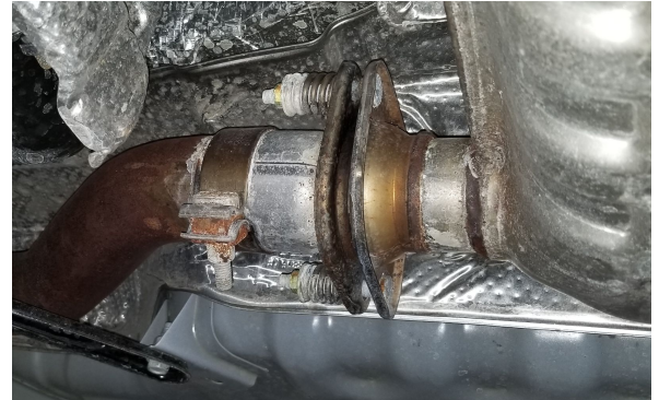
Detail 5: Flanged catback connection

PERFORMANCE LEADS INSTALLATION INSTRUCTIONS PAGE 2