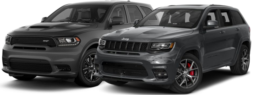
2018+ Jeep Grand Cherokee Trackhawk 6.2L 2018+ Dodge Durango SRT 6.4L (JEEP62CAT)

Thanks for purchasing a Stainless Works Performance Lead Pipe system for your 2018+ Jeep Grand Cherokee Trackhawk 6.2L or 2018+ Dodge Durango SRT 6.4L. Our team has worked to ensure that this product is the premium in performance, quality, and fitment. We are proud to say that this system will unleash the true character of your vehicle. We encourage you to read through the following steps, and check the included Bill of Materials before beginning. Please follow these steps to ensure that your installation goes as planned.