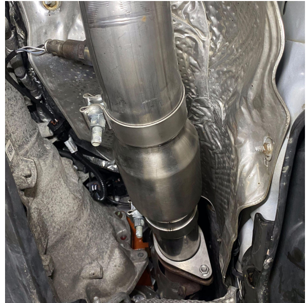
Detail 10 - 13: Manifold connection