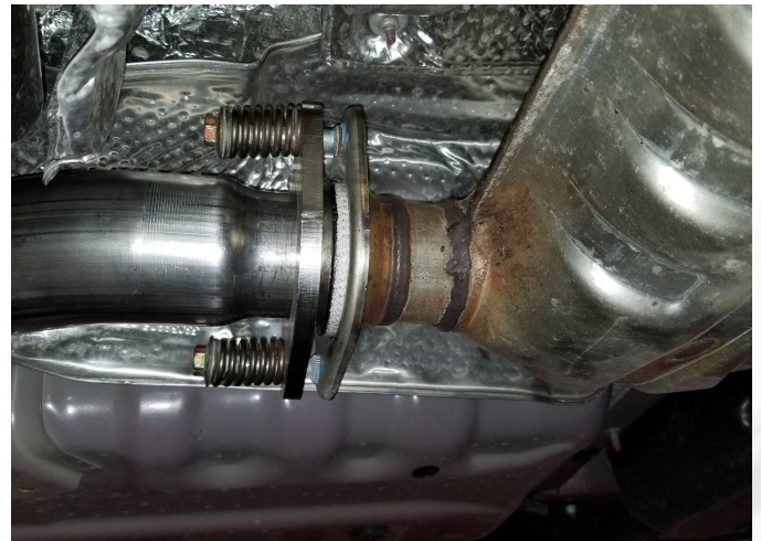
Detail 12: SW to OEM catback connection