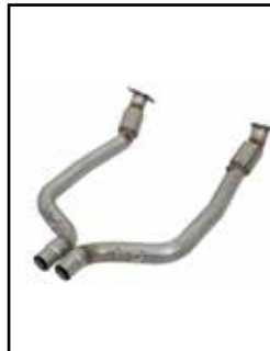
Exhaust Connection Pipes

P/N: 48-32015-YC (Street) 48-32015-YN (Race)