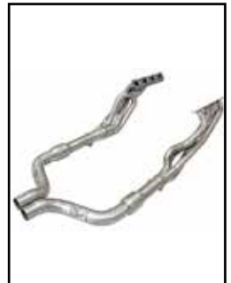
Long Tube Headers

P/N: 48-32014-YC (Street) 48-32014-YN (Race)