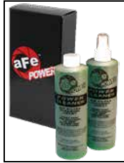
Pro DRY S Restore Kit