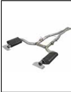
Cat-Back Exhaust System