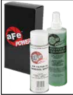
Blue Aerosol Restore Kit