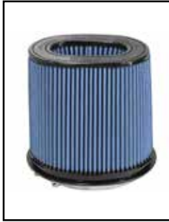
Pro 5R Air Filter