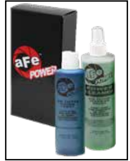
Blue Squeeze Restore Kit