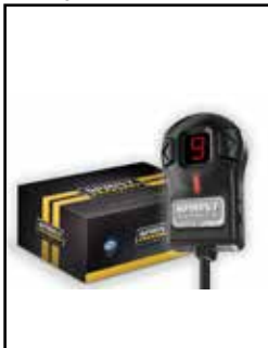
Sprint Booster V3

P/N: 48-32014-YC (Street) 48-32014-YN (Race)